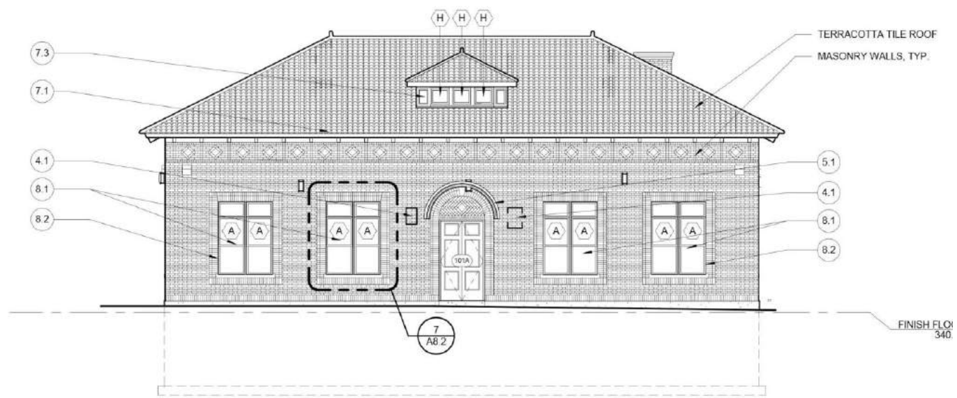
3 EAST ELEVATION A3.1 1/8" = 1'-0"